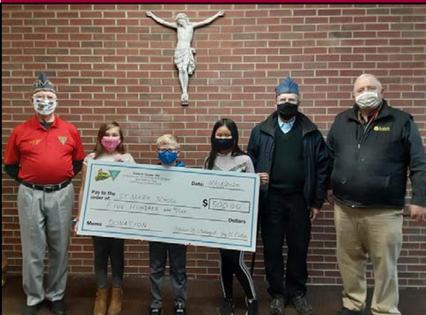
Voiture 145 donated $500 dollars to St. Mark Catholic School for its needy children's fund.