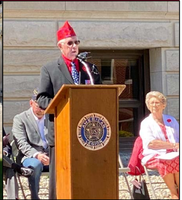
American Legion Post 205 Honor Guard posting Colors