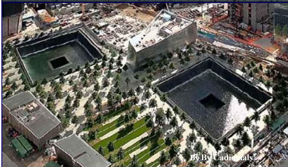
By By Cadiomals