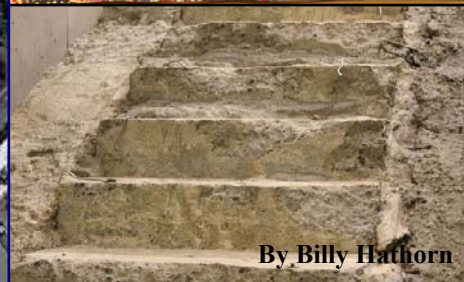
By Billy Hathorn

The National September 11 Memorial & Museum (also known as the 9/11 Memorial & Museum) is a memorial and museum in New York City commemorating the September 11, 2001 attacks, which killed 2,977 people, and the 1993 World Trade Center bombing, which killed six. The memorial is located at the World Trade Center site, the former location of the Twin Towers that were destroyed during the September 11 attacks. It is operated by a non-profit institution whose mission is to raise funds for, program, and operate the memorial and museum at the World Trade Center site.