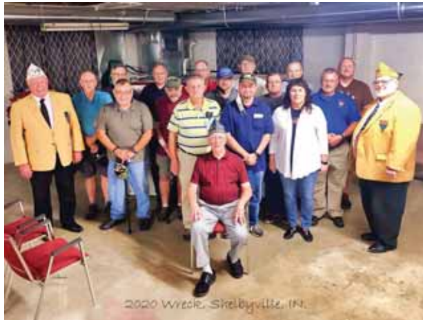
GRANDE DU INDIANA WRECK