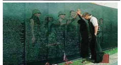
IN MEMORY OF ALL PERSIAN GULF WAR VETERANS