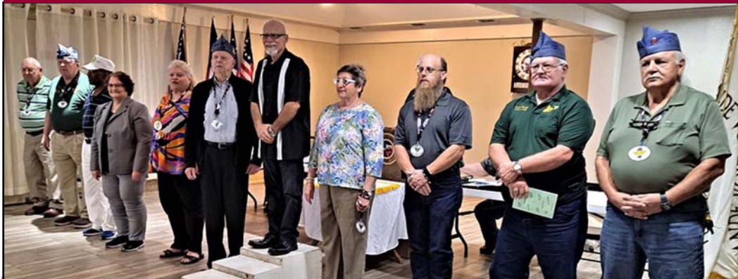
Grande Voiture du Texas welcomes new members during Spring Cheminot wreck on March 5, 2022.