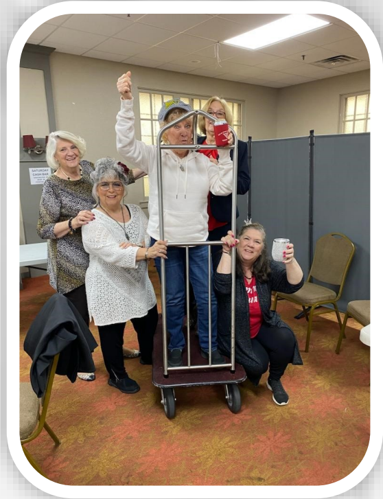
Above: The fun train arrives at the Cajun!!